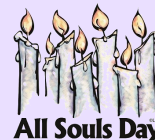
All Souls Day

All Souls envelopes are now available at the entrance of the church for those who wish to include them in the Mass Intention of All Souls Day, November 2, 2022 . These envelopes can be dropped into the white collection box at the entrance of the church or into the rectory mailbox on or before the Day of All Souls. The names will be collected and displayed during the month of November at all Sunday Masses after communion. We ask that all names be clearly written on the envelope.