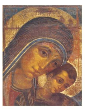
Word of Good News For Youth And Adults